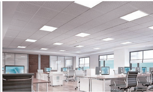
LED Slim Panel EcoMax Power III