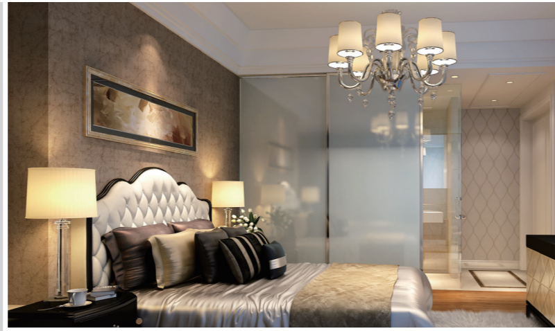
LED EcoMax1 Bulb